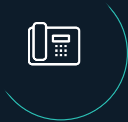
Telephone System with VOIP