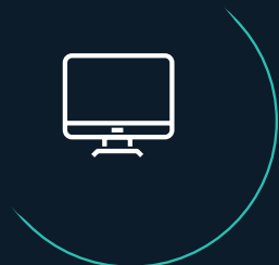
Fibre Internet & CAT 6