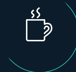
Tea & Coffee